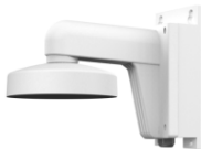
DS-1273ZJ-130B Wall Mount with junction box